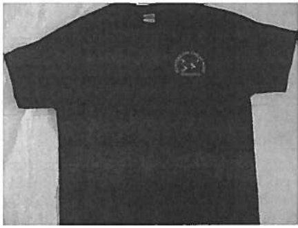
short sleeve $15