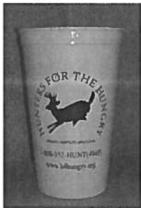
Stadium Cup $1.00 each or 6 for $5.00