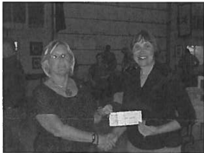
A highlight of the evening was a $1,000 donation presented by the National Capital Area Chapter of Safari Club International.