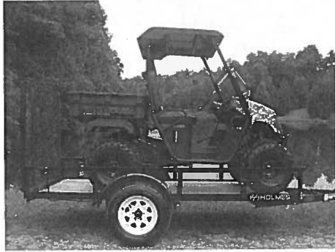
New 2014 Land Master UTV & 2014 Holmes Trailer