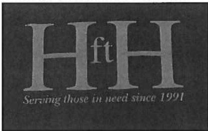
artwork on back of both shirts