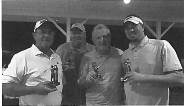
The Dibert Valve & Fitting Team takes Second Place in the First Flight.