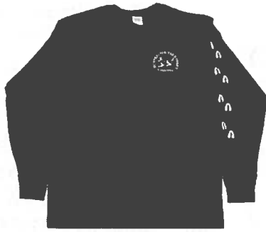
long sleeve with deer tracks on sleeve $20