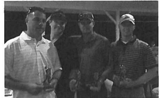
The Conservation Officers Team takes Second Place in the Second Flight