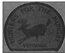
Patch - $3.00