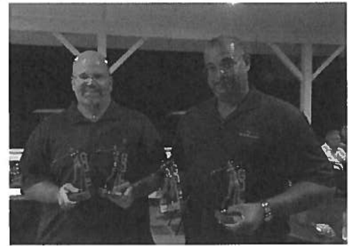
The Georgia Pacific Team took first place in the Second Flight