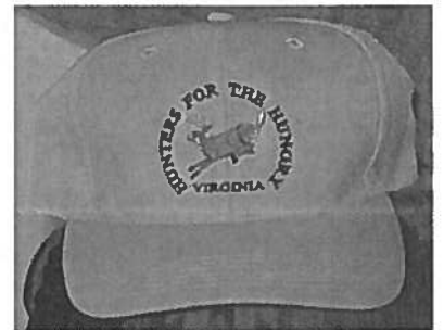
Blaze Orange Cap Only $12.00