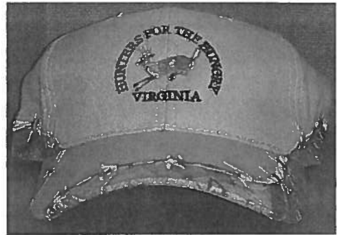
Barb Wire Cap