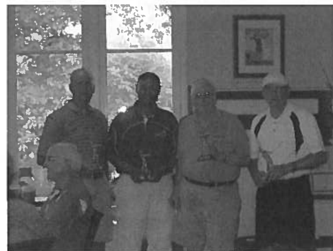
Congratulations to The Winning Team!