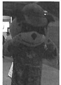
Southpaw, the Hillcats Mascot, looks great in his Hillcats HftH Night Shirt. Visit our website to order yours, www.h4hungry.org .