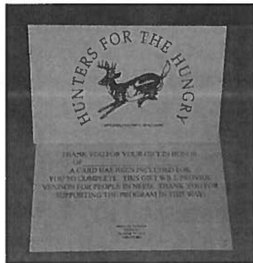
Gift card - In Honor or In Memory