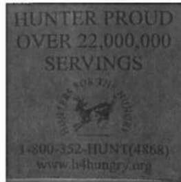
Decal - $1.00

Our shirts are black with blaze orange print. These quality Gildan shirts are 100% preshrunk cotton and are available in sizes small to 4x.